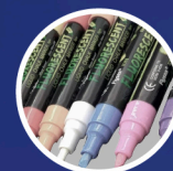
Stationary and Others