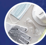
Personal Protective Equipment (PPE)